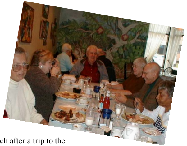
St. Paul's Seniors and friends enjoy lunch after a trip to the Botanical Gardens