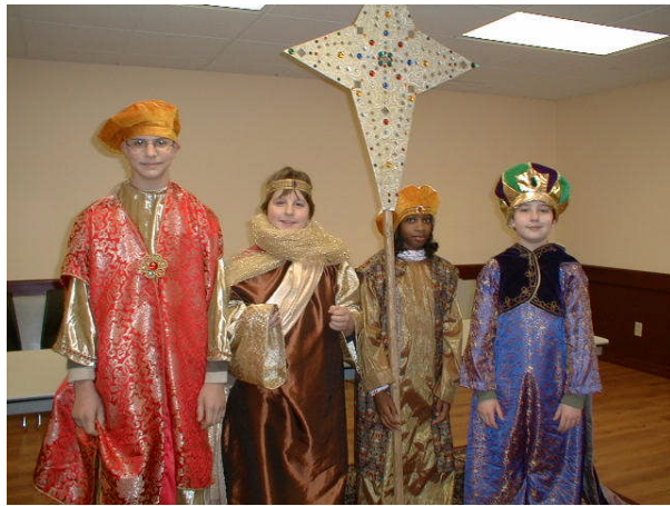
Three Kings Day Celebration - Three kings and a page.

After the service, all the children greatly enjoyed the party and cake with hidden gold coins.